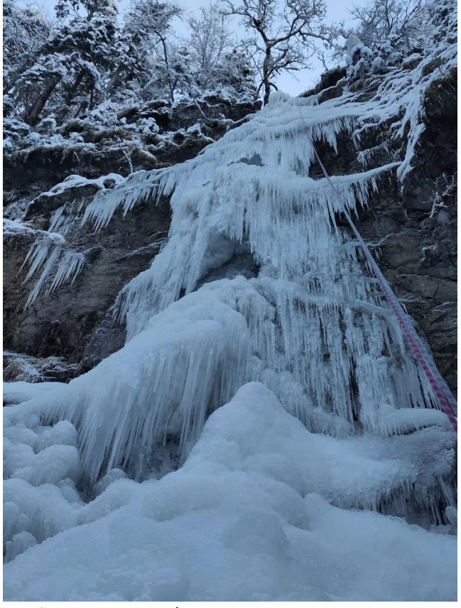
Ernstfall, 50m, WI 4+/5 Belay on a tree directly on the path. To use the thickest trees, 60m ropes are needed.